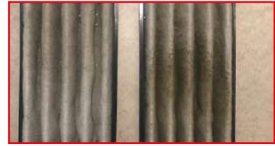
Stage 3 After 6 months have passed you need to check your filters. Depending on the state of your filters (as shown above) you need to change the filters.