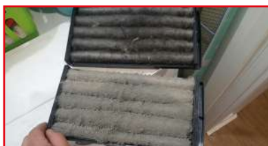
The No Go Zone This is the worst stage and you should always ensure you never let your filters get this bad.

The ComfoAir MVHR is constantly filtering the indoor air. These different stages show how much air pollution can take place inside your home. Always make sure you are checking and changing your filters!