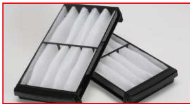
Stage 1 Brand new filters fitted into your MVHR.