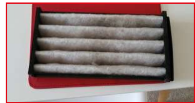
Stage 2 After a few months, there will be signs of wear and tear.

The ComfoAir MVHR is constantly filtering the indoor air. These different stages show how much air pollution can take place inside your home. Always make sure you are checking and changing your filters!