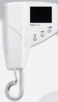
Model BLV2 2 way bellini system