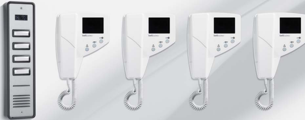
Model BS4 4 way system

Each standard BS packaged system provides all of the components necessary to install a complete video door entry system. A standard multiway BS system comprises of: