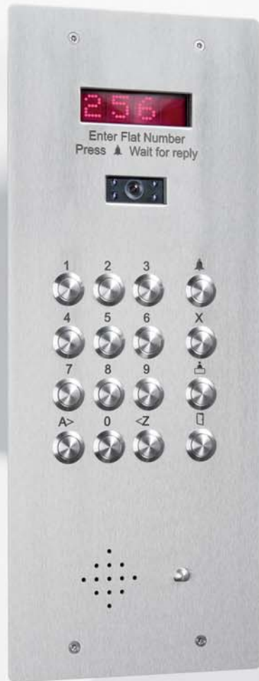
digital V/R options