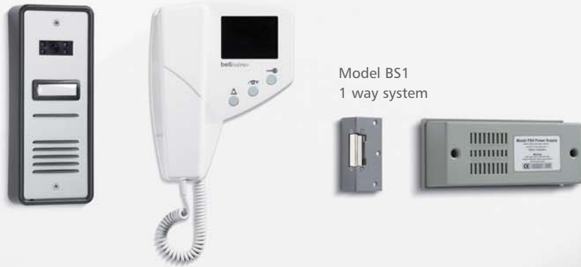
Model BS1 1 way system