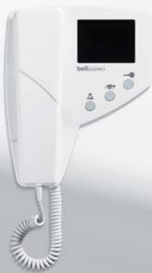
Model BS4/VR 4 way V/R system