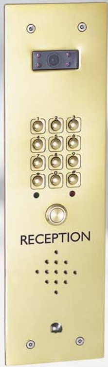
combined brass options