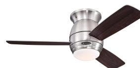
Reversible Dark Cherry Finish Blades