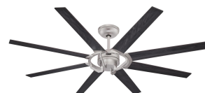
Reversible Wengue Finish Blades