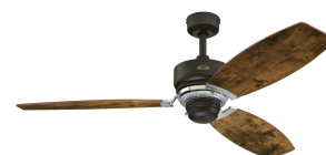
Reversible Reclaimed Hickory Finish Blades