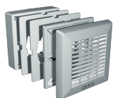
F 150/6" Code 22133