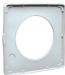
S 150/6 Code 22156