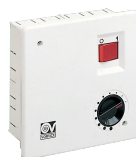
SCNRB SCAT.COM.NON REV.INCASSO