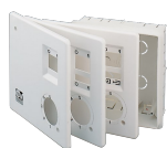
KIT SCB (TRASF.E.C.)