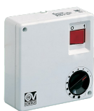
C 1.5 (COMANDO EL. 1.5 A)